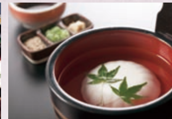
Home made tofu

We can also provide other amenities such as trouser press, side lamp and iron (on demand). Please feel free to contact us in advance if you have any further questions.